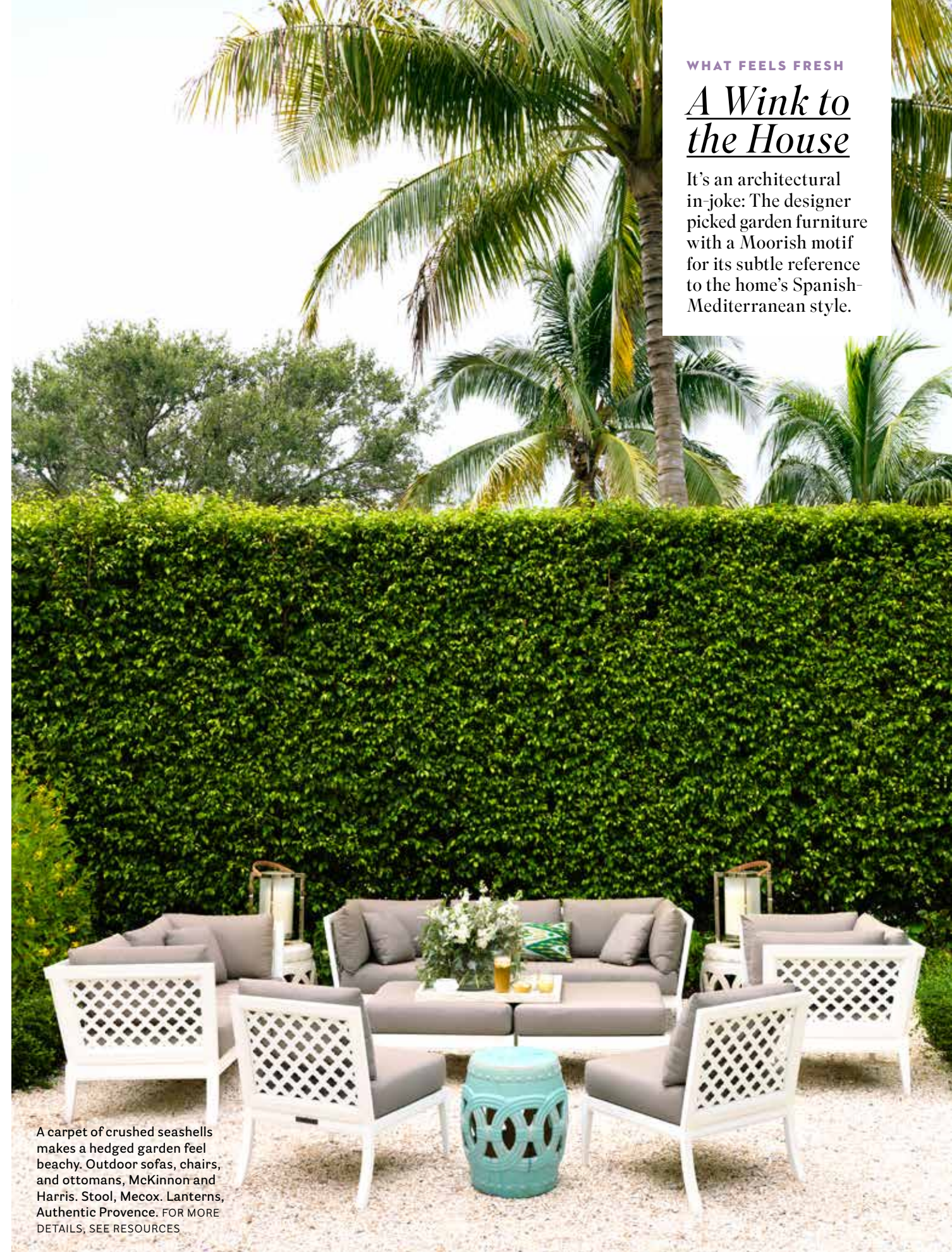
A carpet of crushed seashells makes a hedged garden feel beachy. Outdoor sofas, chairs, and ottomans, McKinnon and Harris. Stool, Mecox. Lanterns, Authentic Provence. FOR MORE DETAILS, SEE RESOURCES