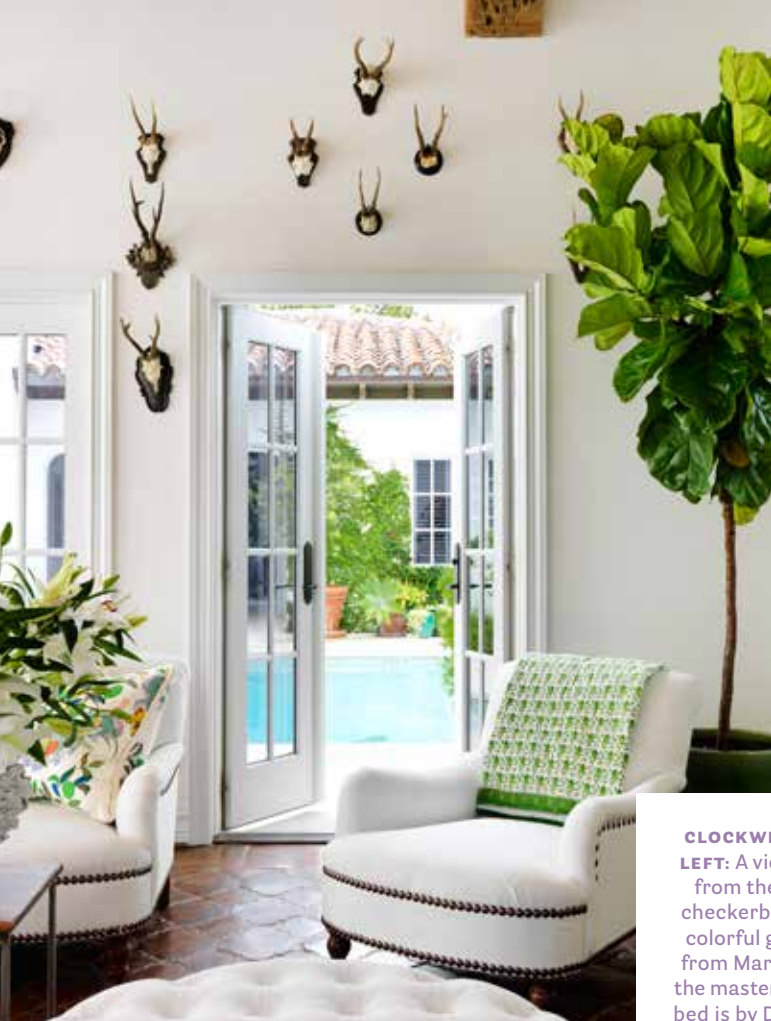
CLOCKWISE FROM TOP LEFT: A view to the pool from the loggia. The checkerboard tray and colorful glassware are from Mary Mahoney. In the master bedroom, the bed is by Dessin Fournir; wallcovering, Celerie Kemble for Schumacher; chandelier and table lamps, Arteriors; rug, Stark. Comfortable Gloster chairs in the outdoor dining area encourage diners to linger; pendant, Vaughan.